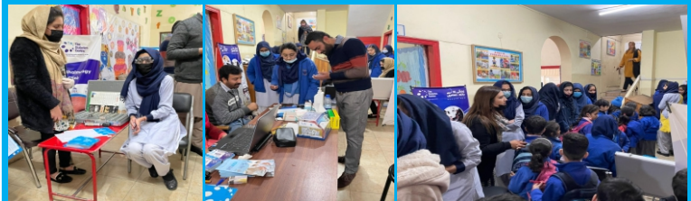
TDC's Specialists treating the students at Allied School G-10, Islamabad