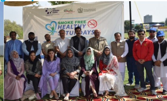
The District Administration of Islamabad and TDC's Management Inaugurating Healthy Saturdays. Also Busy at Group Photo session.

TDC organized a free Diabetes awareness and free screening camp on 19th of March, 2022 at F-9 Park in Islamabad. This camp was collaborated by the Ministry of Health under its Smoke-Free Healthy Saturdays. Among other collaborators, Safa Gold Mall, Safa Fitness Club, and Daraz were prominent names.