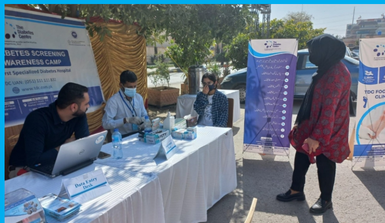
Diabetes Specialists facilitate free screening at NUMS

On the 15th of March 2022, The Diabetes Centre (TDC) organized a diabetes-free screening camp. This camp was held at National University of Medical Sciences (NUMS) in Islamabad. Its purpose was to educate people about diabetes and its related complications. The medical specialists delivered informative messages and speeches to students and urged them not to take light the symptoms of diabetes at any stage. It was emphasized to fight against diabetes by taking healthy foods. At this spot, TDC representatives highlighted the vision of 'Better health for a brighter future' as valuable. Students were urged upon to be conscious about their eating and life style habits at an early stage. This way, they can only keep themselves healthy for a longer period of time and be useful for themselves, their families, and the community they live in.