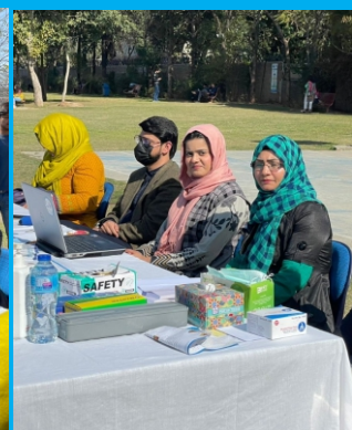
TDC's Camp at Szabist Highlighted the Diabetes Awareness