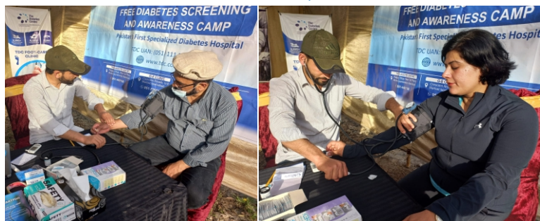
Public Getting Free Checkup and Treatment at Rose and Jasmine Garden

The Diabetes Centre (TDC) organized two days free diabetes camp on 12th and 13th of March, 2022 at the Rose and Jasmine Garden in Islamabad. Its purpose was to raise awareness among people about diabetes and its related complications. A large number of people joined this screening camp and benefited from a free check-up against diabetes. At this screening camp, various healthcare-related services, which include Diabetes Screening, Nutritionist Consultation, Diabetologist Consultation and Medicines were provided.