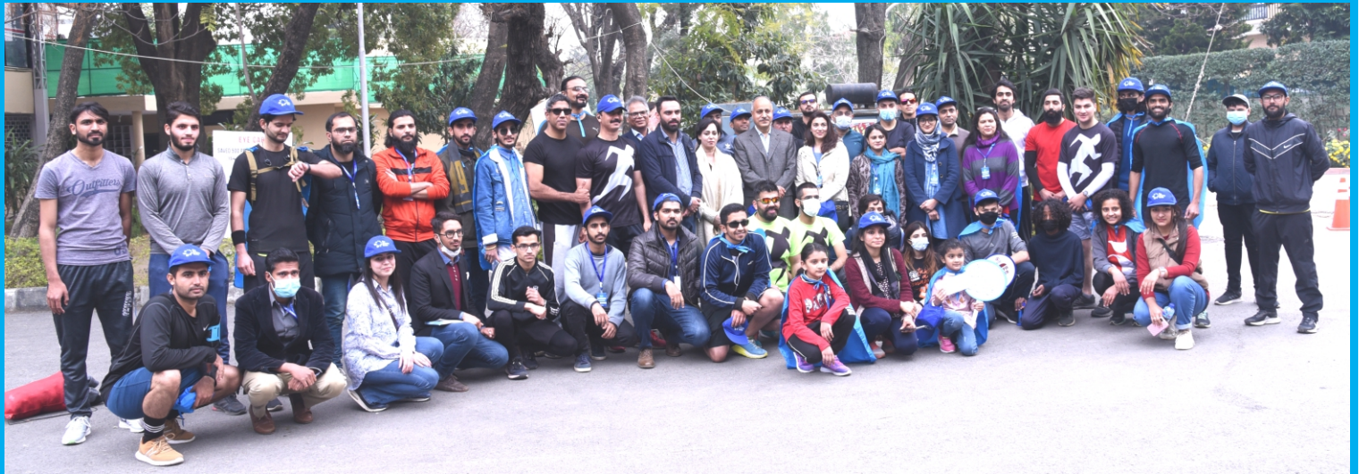
Group Photo of Participants of "Diabetes Awareness Run" along with CEO TDC