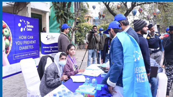
Nutritionist from TDC briefing the participants about diet and obesity treatment