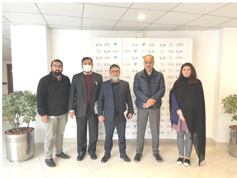
Group photo of CBM team along with TDC Officials