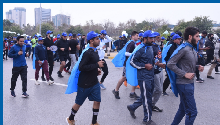
People from all age groups took part in "Diabetes Awareness Run"